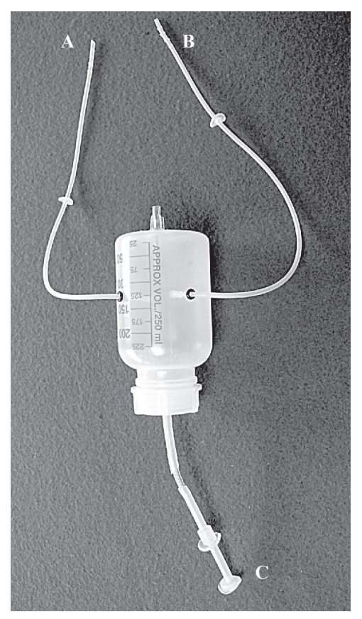
A - pancreatic catheter B - bile catheter C - duodenal cannula

During first day after surgery, duodenal cannula was closed while both catheters remained open to allow not restraint secretion flow and implantation sites healing. During 7-10 days of recovery period animals were kept in individual pens equipped with the collection bottle (Figure 2).